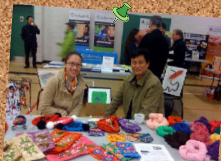
Crocheted hats by Yu Ying Chen.