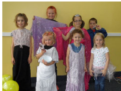
Spotlight Theatre Company drama workshop in Summerside