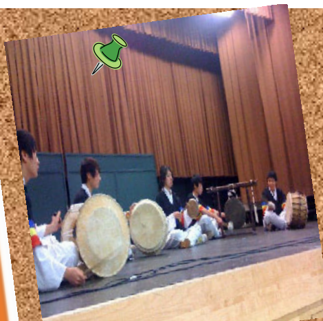
Raonzena Korean Samul Nori Drum band