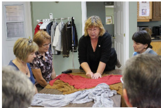
Knitting workshop in Wellington