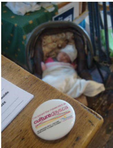
Possibly PEI's youngest Culture Days participant at Village Pottery, New London